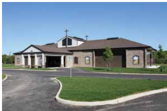
Coram, New York

Old Westbury NY 11568 (516) 334-7990 www.cclongiland.org