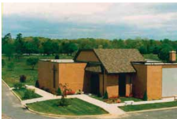
Central Islip, New York