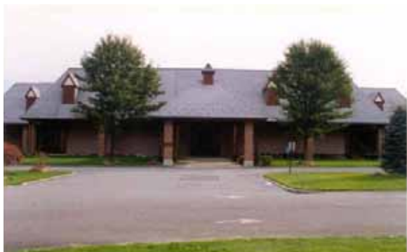
Westbury, New York